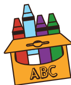
Goods to Continue Child Care