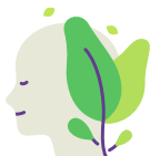
Mental Health Support for Staff & Children